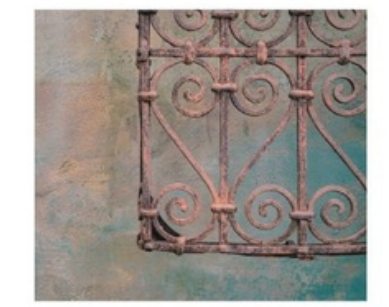
22 - 25 MAY 2023